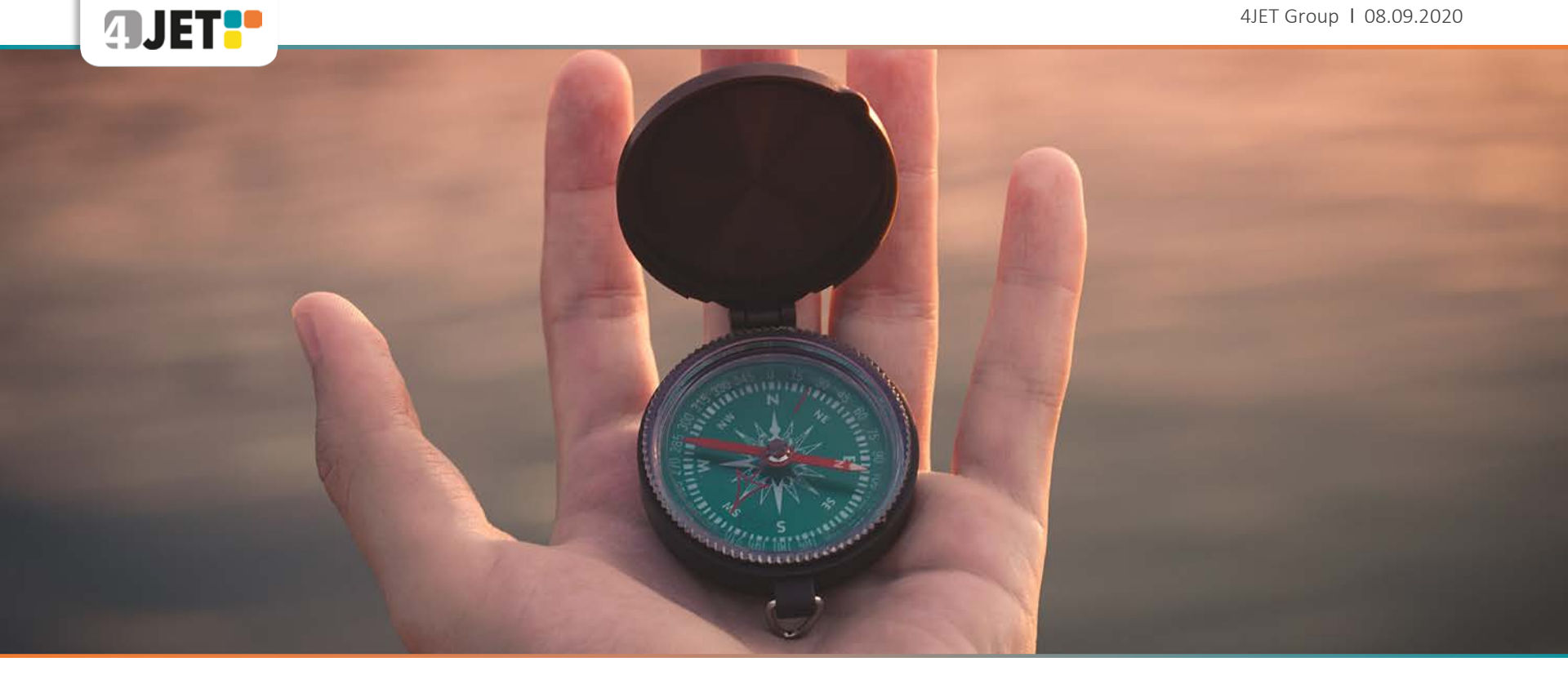
The "Aachen guide"